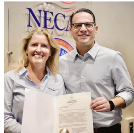
Mayor Fournier with Governor Shapiro

St. Gert's Church Bullock Ave & Merion Ave 7AM- 8PM